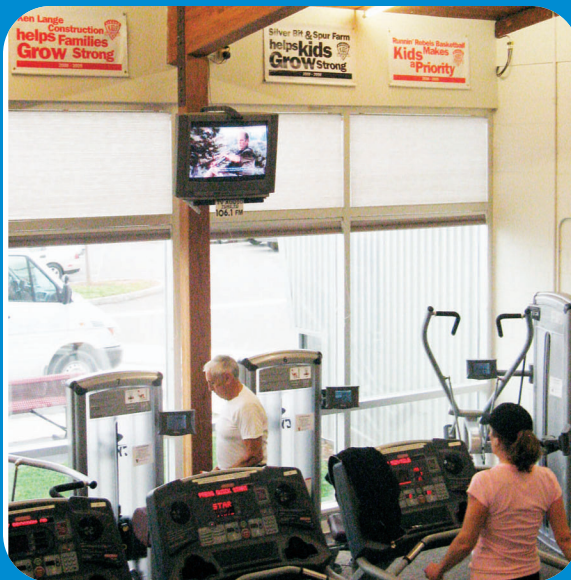
Deer Path Branch in Flemington

Don't miss your chance to have banners with your business name displayed at the two branches of the Hunterdon County YMCA!