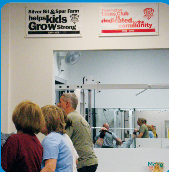
Round Valley Branch in Annandale